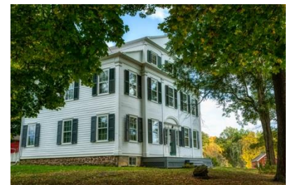
Locust Lawn (1814) – Gardiner, NY

Remaining in the family until 1958, it had many Federal architectural features and original furniture. Gifted by the last family member to Historic Huguenot Street, later, in 2010, it was transferred to Locust Grove Museum in Poughkeepsie. It remains as a museum with tours by appointment.