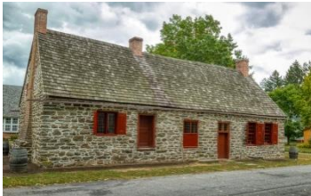
Abraham Hasbrouck House

The doorway stoop project is in the final design and spec stage of development. After additional study of the topography in front of the house, it was determined that a stoop cannot be built for the center door. This is due to the high ground level today as compared to even fifty years ago.