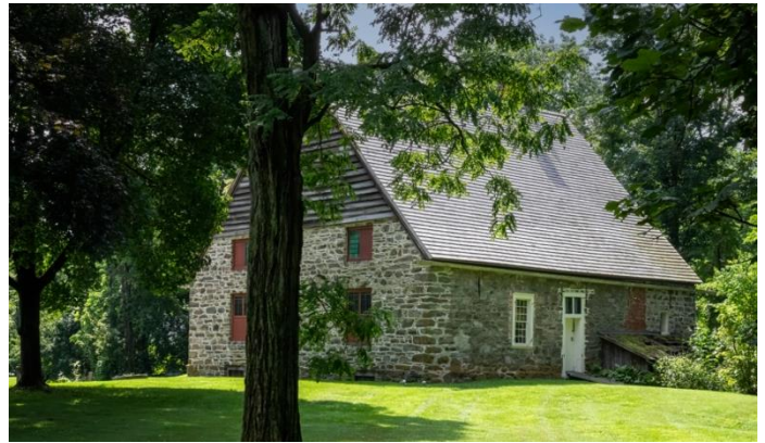
Jean Hasbrouck House – NW Corner

The stairs to the basement are protected by a cover with cedar shingles. This will be rebuilt with lumber cut in dimensions of the era of mid-late 1700s and will have the same shingles as is now on the roof of the house. The rear wall will be cleaned, and mortar repointed to match the original pointing style seen on the north wall.