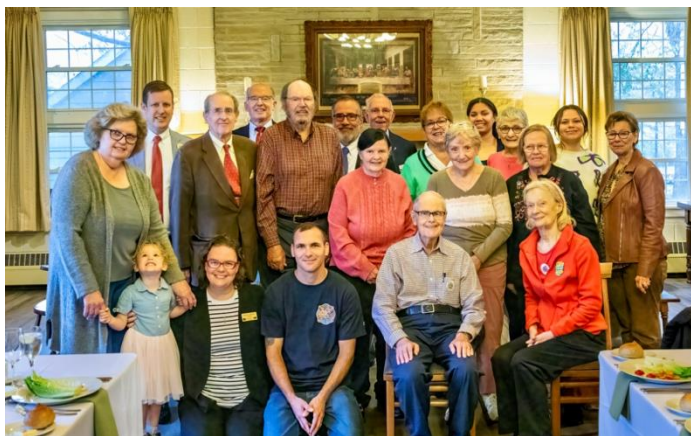
HFA Annual Reunion 2023 Attendees